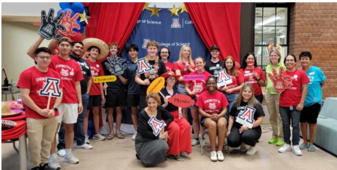
COS NEW STUDENT WELCOME EVENT

Check out the CBC social channels to view photos from the College of Science New Student Welcome Event and the CBC Salsa Challenge. No Facebook account is necessary!